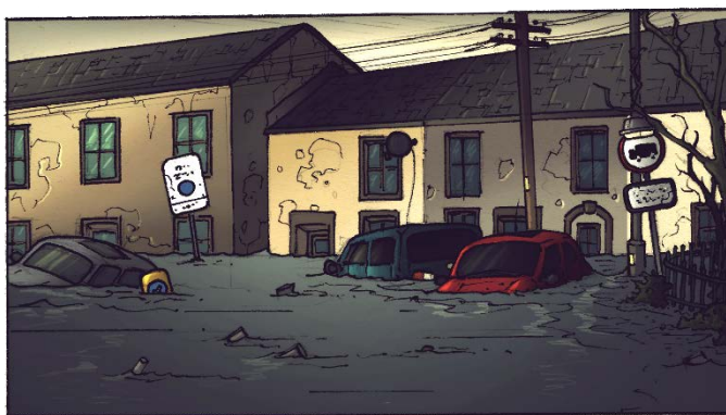
Cars down a main street in Cockermouth were left abandoned as the river rushed through the town.

Look at the picture and caption below. Why has the author used these in the article? What effect does it have on the reader? The picture looks like anyone’s street. It is used to shock the reader into caring about the problem. The picture is meant to represent any street in the UK.