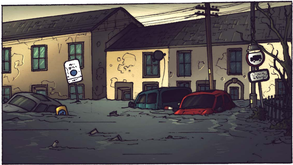
Cars down a main street in Cockermouth were left abandoned as the river rushed through the town.

Look at the picture and caption below. Why has the author used these in the article? What effect does it have on the reader?